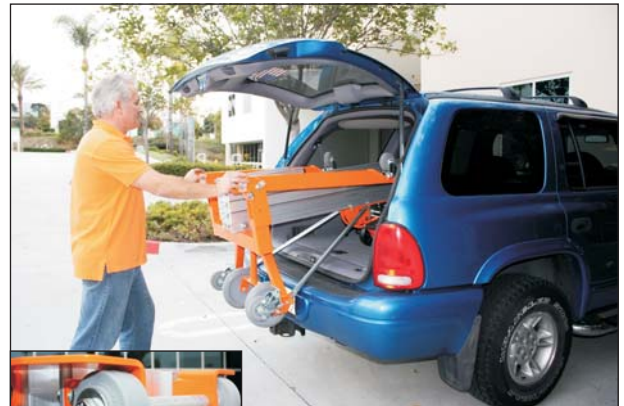
Industry-leading transportability. SUV, van, and small truck friendly.