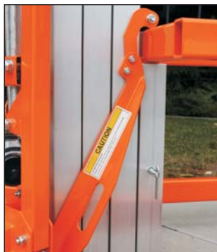
Hold down can be actuated when stabilizers are stowed.

Precision cast metal cable pulleys, folding leg slide pads, non-marking leg wheels, and Clear-Path™ foot clearance.